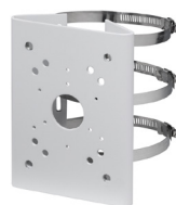
PFA150 Pole Mount