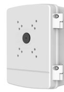
PFA140 Water-proof PowerBox