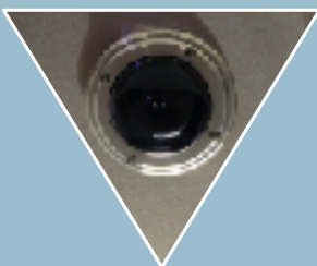
Stainless steel corner mount kit

Easy to install all cameras come complete with 1.8 metres BNC power cable, Stainless steel tamper-proof screws and Hex key as standard