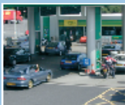
High Colour by Day