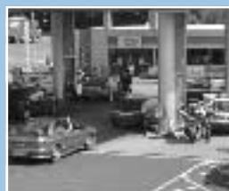
High Monochrome by Night