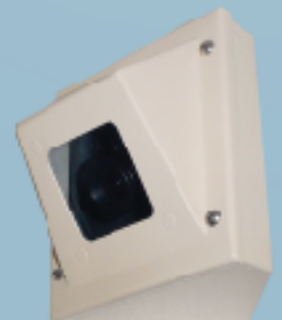
CSP-430 Corner Unit

Ideal for: Banks, Shops, Lifts, Airports, Car Parks and Prisons.