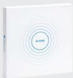
AC2000 AC2000 Airport