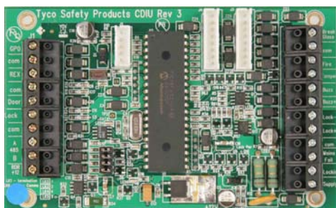
DIU 200 Module

As an added benefit, the DIU 200 monitors the status of all standard door monitoring inputs; inputs on an intelligent CEM reader are free for use as general purpose inputs.