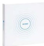
AC2000, AC2000 Airport AC2000 Lite