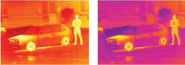
Thermal image in glow bow mode / Thermal image in iron bow mode