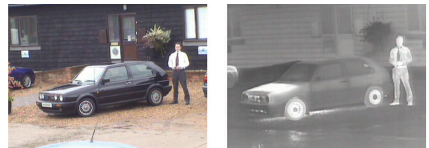
Optical image / Thermal image in white hot spot mode