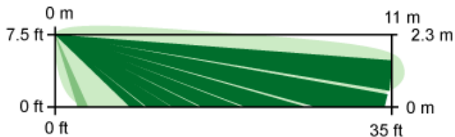
Side View Broad: 11 m x 11 m (35 ft x 35 ft)