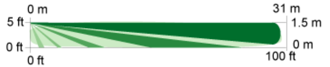
Side View Optional Long Range Coverage: 30.5 m x 3 m (100 ft x 10 ft) Requires optional ORL92-3 lens.