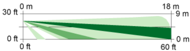
Side View Standard Broad Coverage: 18.3 m x 18.3 m (60 ft x 60 ft)