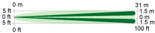
Top View Optional Long Range Coverage: 30.5 m x 3 m (100 ft x 10 ft) Requires optional ORL92-3 lens.