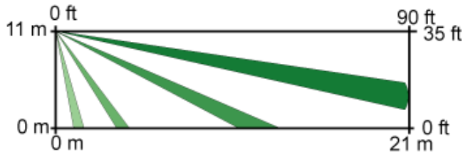
Side View Standard Broad Coverage: 27 m x 21 m (90 ft x 70 ft). The standard broad coverage mirror (OA90) is included.