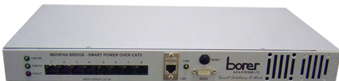
RACK MOUNTING MIDSPAN BRIDGE Part No. 04-137