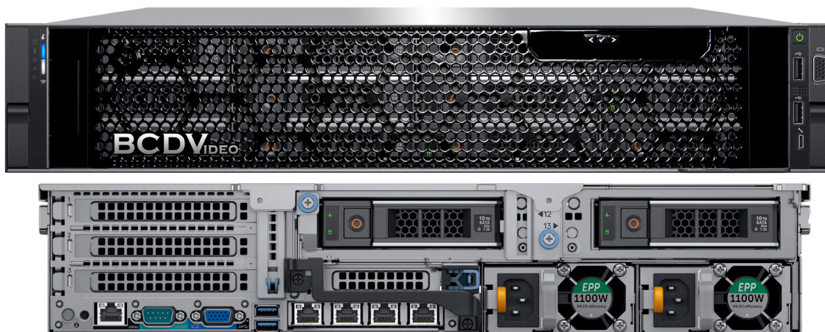
Back - Single Processor Models

5-Year, On-site, NBD, Keep Your Hard Drive Warranty