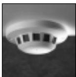
SD-300/A Standard resolution monochrome option