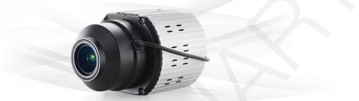
Lens Sold Separately

8.3 Megapixel (MP) H.264 True Day/Night Indoor Box-Style IP Camera with SNAPstream™ (Smart Noise Adaptation and Processing), NightView™, and WDR (Wide Dynamic Range)