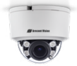
Surface mount dome