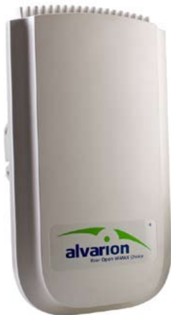
BreezeMAX Extreme Deployment Scenarios