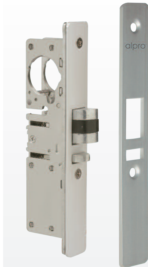
524510 Lock Type