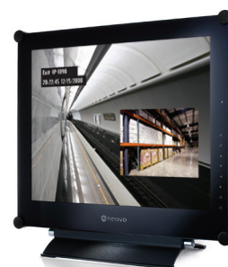
Smart Omni Viewer provides flexible image viewing options such as PIP/PAP, freeze, 180° image rotate