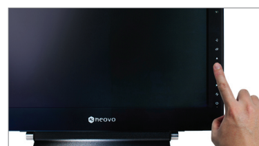
Durable metal casing for enhanced strength and secure mounting