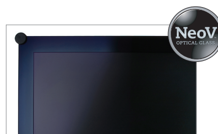
NeoV™ Optical Glass protects against scratches, impacts and other physical damage