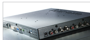
Ultimate video versatility, including passive looping BNC video for multiple display connections