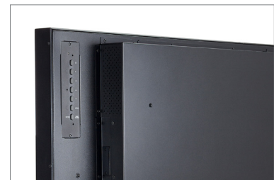
Durable metal casing for enhanced strength and secure mounting