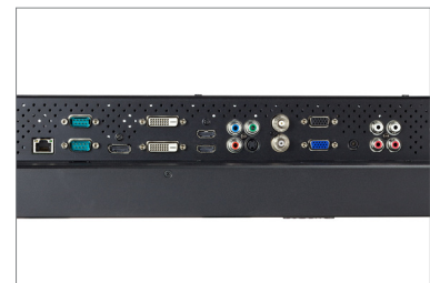
Multiple video inputs (VGA, DVI, HDMI, BNC, S-Video, DisplayPort and Component) allow for effortless system integration