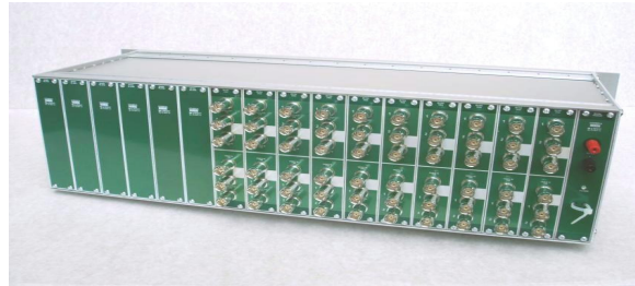
BH193/3125 (Left) and integrated with BH220 (above)