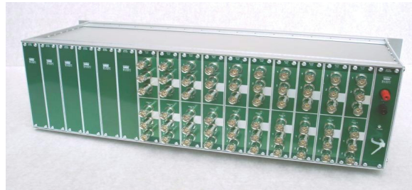
BH192/3125 (Left) and integrated in BH220 (above)