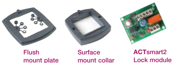
Flush mount plate