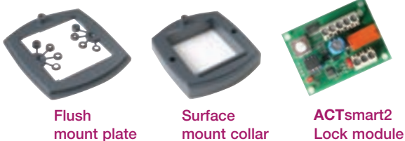
Flush mount plate