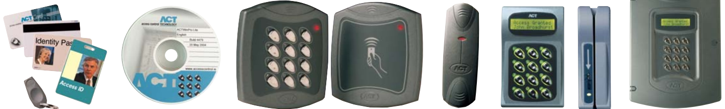
ACT Cards and Fobs

PC Specification: ACTWin software requires Windows 9X or Windows NT - XP