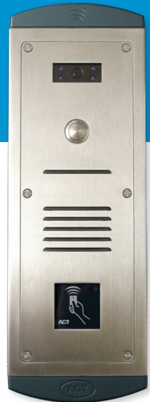
ACTentry V-IP X Entry Panel with panel mount proximity reader (sold separately)