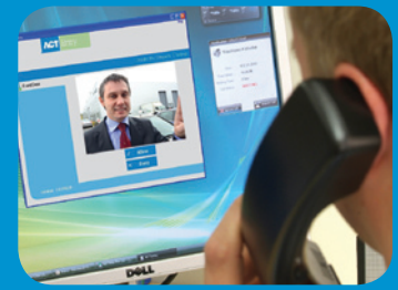
PC Handset & V-IP Software