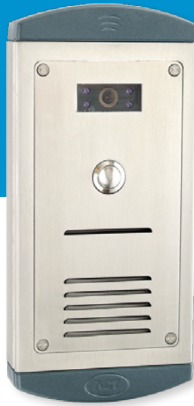
ACTentry V-IP Entry Panel