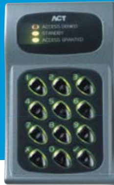
ACT 10 Digital Keypad