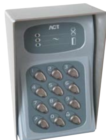
ACT 10 Weather Shield