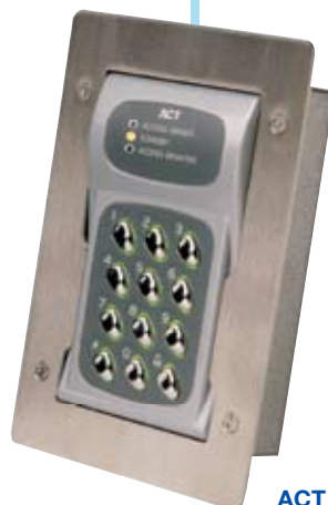
ACT 10 Flush Kit