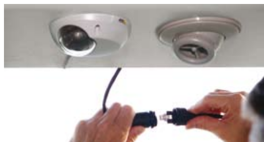
One cable is all it takes when installing an onboard network camera, eliminating the need for a separate power cable. The connector types used, e.g. M12 or Woodhead, are suitable for mobile transportation.