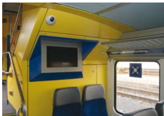
The AXIS 209 Network Cameras measure only 4 cm (1.5 in.) high and 10 cm (4 in.) wide. Their compact, discreet design and rounded edges make them ideal for onboard mounting in ceilings or on walls.

Operators also benefit from Axis' Active Tampering Alarm. This helps to ensure that the cameras are fully operational at all times: if someone is manipulating the camera, for instance by spray painting or covering the lens, the camera automatically sends an alert.