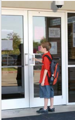
From the Design Side, continued

Contact your Vicon Sales Representative to obtain a copy today.