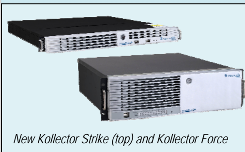
New Kollektor Strike (top) and Kollektor Force

Kollektor Strike units will begin shipping later this month. The Force units will follow later this year.