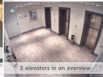
3 elevators in an overview