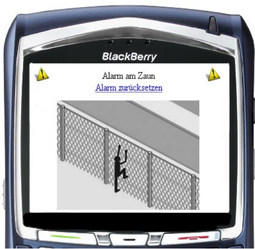
Direct alert to a terminal: The security personnel decide what steps to take next

Netzlink works with leading partners from different specialised areas. The advantages of the BlackBerry Enterprise Solution are effectively combined with innovative fence technology by Haverkamp GmbH and intelligent camera technology by Geutebrück GmbH. The integration of security technology with mobile clients opens up a wide range of possibilities for expanding existing security concepts in an effective way. The modular design of the deployed components enables us to produce solutions tailor-made to your needs.