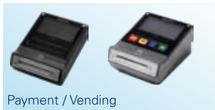
Payment / Vending