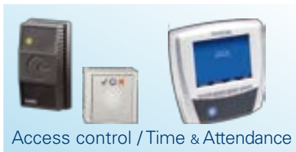
Access control / Time & Attendance