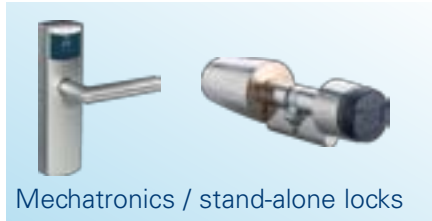
Mechatronics / stand-alone locks