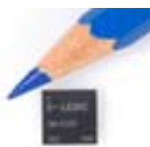
LEGIC advant reader chip SM-4200 size 8x8 mm (1:1 illustration)

The new LEGIC advant SM-4200 reader chip becomes your preferred choice for battery powered and standard applications. The extensive interoperability combined with a ready-to-use encryption package opens unrivalled possibilities for contactless applications. The reader chip meets all major RF standards including ISO 14443A+B, ISO 15693 and others for single or multi-technology designs.